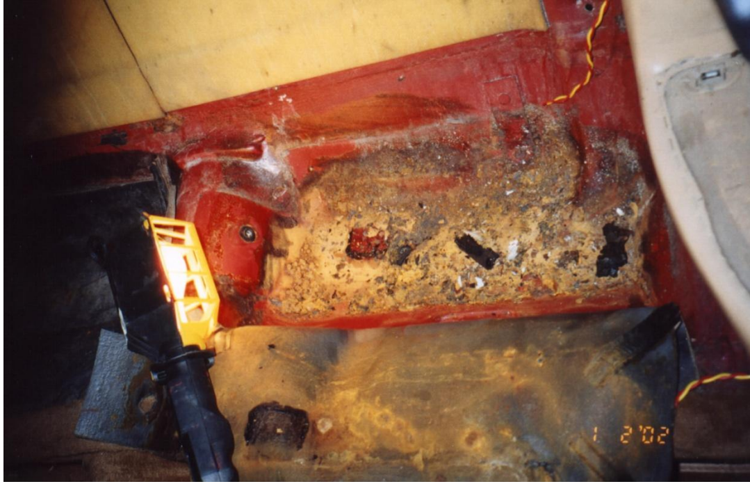
Figure 3 Right Rear Floor Pan