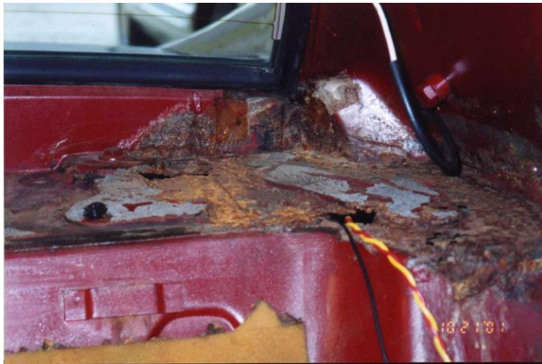
Figure 1 Left Parcel Shelf

The rear window seal was replaced when the car was repainted in 1988. Unfortunately, the glass tech didn't know how to do the job right (see Rear Window Seal Replacement). The Circuit City tech installing a new antenna in the mid 1990s must have known about the problem since he took advantage of the rust hole in the parcel shelf to run his wires, but he said nothing. By the time I discovered the leakage in 2001 it had done extensive damage to the parcel shelf and the rear floor pans. It cost over $1,000 to fix the damage (see photos). The message is be constantly watchful for leakage around all window seals.