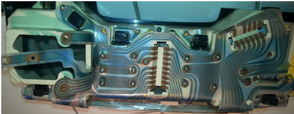
Figure 2 Instrument cluster flex circuit.