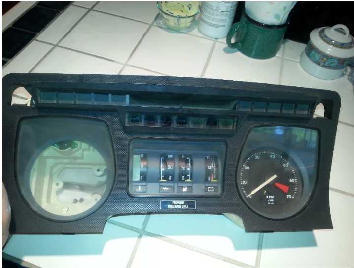
Figure 1 Instrument cluster. Speedo & temperature gauge removed.

Consequently, the true mileage is that shown on the new speedo + 44405 + 100000.