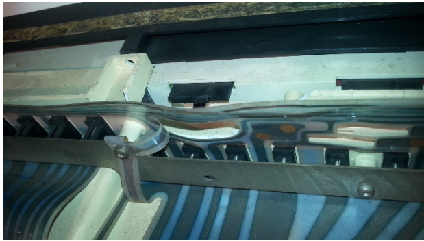
Figure 4 Flex circuit delamination problem.