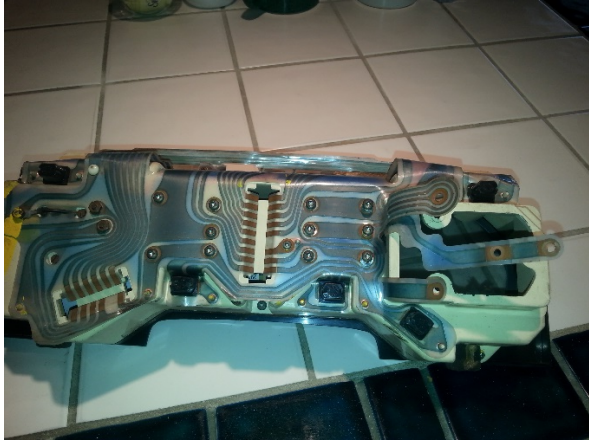
Figure 3 Instrument cluster flex circuit